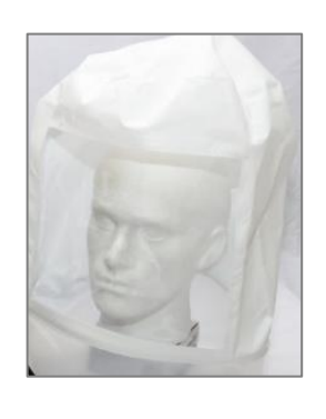
3M Plastic Collar